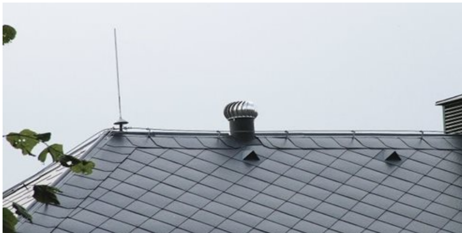
Wind powered ventilation of the attic on the family house

Other sections of a property can be ventilated, especially cellars, bathrooms and toilets. Simply wherever there is a need for continuous ventilation while ensuring economical operation and low purchase costs.