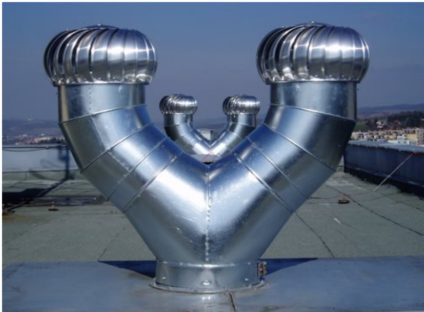
Wind turbines with splitter on a ventilation shaft in block of flats

Can also be used on block of flats where must be a well-ventilated bathroom, toilet and kitchen. The ventilation can be done through a ventilation shaft where turbines are located at the outlet and can replace an electric fan that is noisy, expensive and can often be broken. In the ventilation system, we recommend combining ventilation turbines and fans.