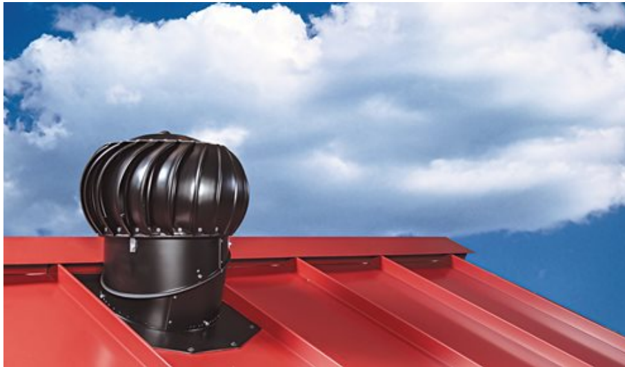
Ventilation turbine mounted on a metal roof directly at the ridge for the best operating conditions.

It is estimated that over 50% of homes show visible signs of improper ventilation.