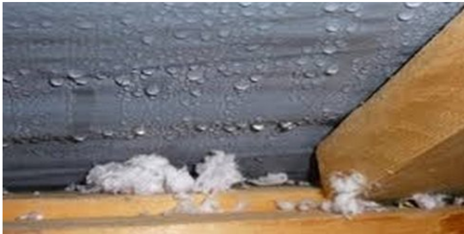
Condensation under the roof

It is a common opinion that condensation in cold ventilated gaps results from a water vapor that penetrates in the gap from the heated attic space through the roof structure. If we ignore the fact that through this structure, which is strictly vapor-proof, should not permeate any moisture at all, there is also an external source of moisture. At night, in the morning, but even in the daytime, if the sun does not shine on the roof, the temperature of the roofing can drop significantly below the air temperature, even by more than 10°C. In other words: whenever we see the grass, trees, cars or roofs covered by a frost or dew, we have to assume that the same situation is in the ventilated gap (well supplied with outside air), that is on the underside of the roofing and on the surface of the waterproofing. Due to proper ventilation ensured by a ventilation turbine, dew and frost from the ventilated gap will generally disappear earlier than from the outdoor surfaces.